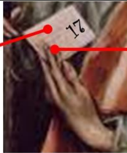
Paul's soft left hand was responsible for some of the longest letters.