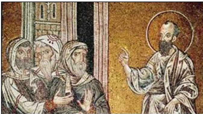
Paul started delivering his own letters until the Corinthians gathered at the post office and told him to "Fuck Off"