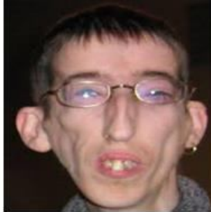
Iduadnum Hyphent, PhD Theorobotic Re-Observationalism