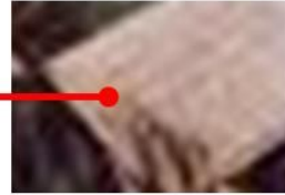
Protein stains on many of Paul's letters prove he ate meat with his fingers on Fridays