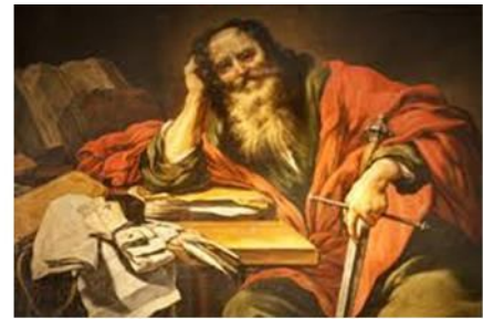
Paul spent huge quantities of time writing and re-writing his letters to Corinthians